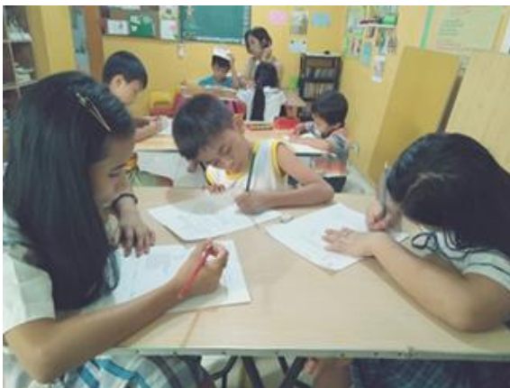
Children at their studies

"Whatever happens remain always at peace and trust the Lord." – Blessed Nicolas Barre