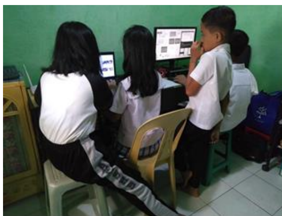
Children using the computers