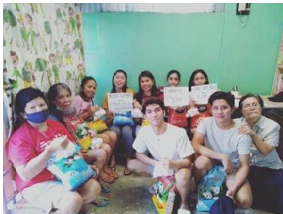
Sr with the adults receiving their parcels of food