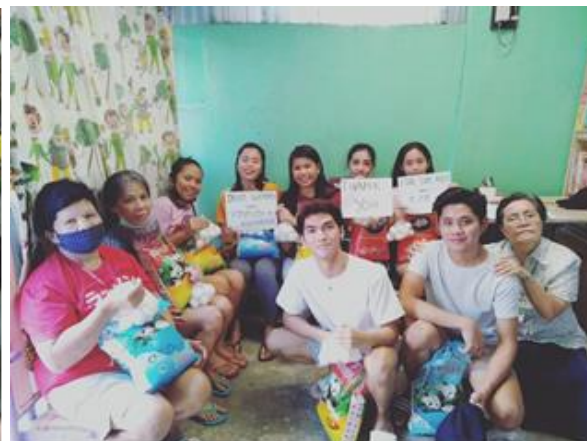
Sr with the adults receiving their parcels of food