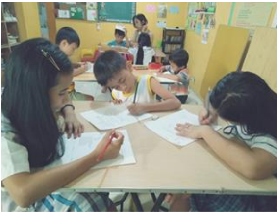
Children at their studies

"Whatever happens remain always at peace and trust the Lord." – Blessed Nicolas Barre