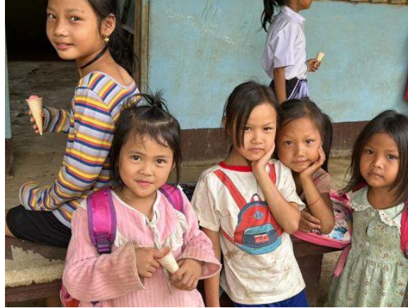
Children from the Lahu tribe at Pana School