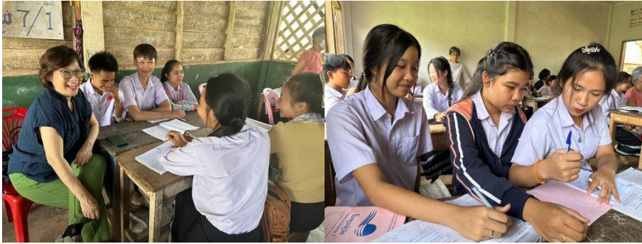
"New teacher" trying her hand at group work

Some of these children may have to drop out from school to work at the casinos.