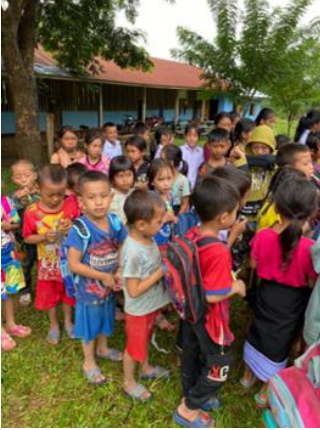
Children queuing to go to class