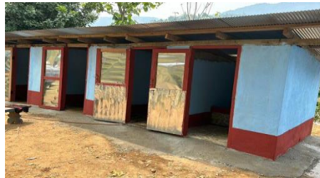
New toilets for students and staff of Pana Primary School

Danthin Secondary school also has new toilets!