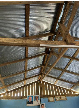
Roof not leaking now – another project