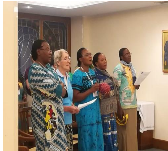
The day ended with Mass prepared by Cameroon.