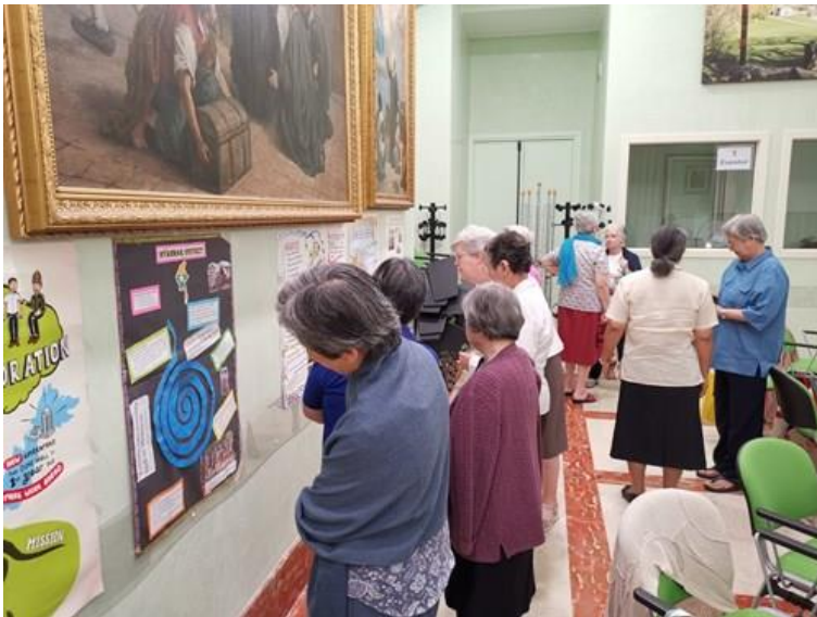
Studying the posters