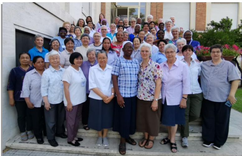
Sisters at the Chapter in Rome

'It has been an honour and a privilege to serve the Institute as a General Council; we feel greatly enriched and blessed. What a joy to visit you in your countries and to meet those with whom you share your mission. We have been inspired by your wholehearted commitment to God's call throughout the Institute. A sincere 'thank you' to each one for your tremendous support and for your love and your prayer. You will always have a special place in our hearts; we thank God for you and ask Him to fill you with his hope and joy.' And, finally, the delegates! The Chapter candle has been extinguished and many papers shredded! We now have a mandate for the next six years! It only covers four pages and it may be hard to believe the hours, days and late nights which were spent refining and refining it! Finally we identified the essential directions of the new paths the Lord is calling us to tread. Moving forward requires fidelity, courage and freedom but we are full of confidence because we know that our God journeys with us; we have each other and many other friends and lay companions. We'll leave the final word to Nicolas Barré: