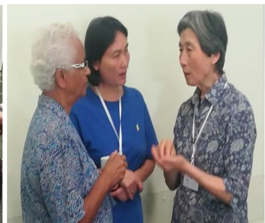
Meeting between meetings – taking a break from Chapter work