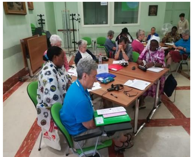
Chapter delegates taking part in the Discernment Workshop.