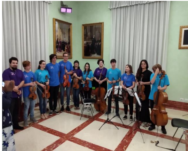
Young musicians who performed for the delegates