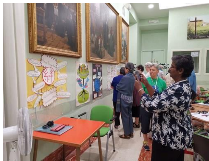
Capturing the presentations