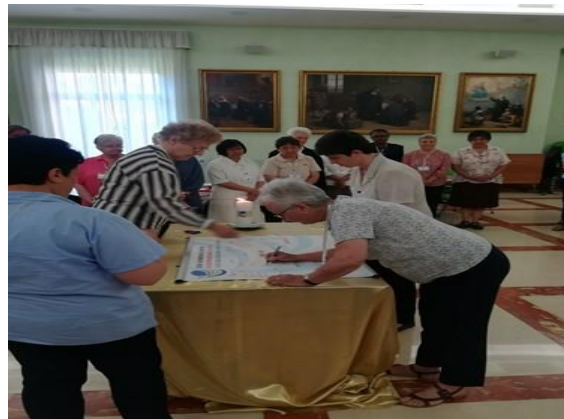
Each delegate signed her commitment to the work of the Chapter on the Logo poster