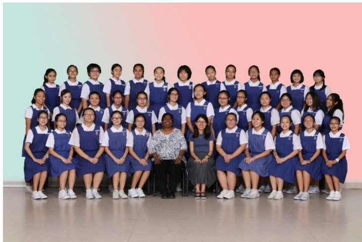
The members with their teacher-advisors

CHIJ St Theresa's Convent IJYM had worked well with their new mission partner, Beyond Social Services, to serve the community, especially the young. Local outreach last year was with Willing Hearts. For 2016, STC worked with another outreach centre. Teachers left the initiative to the IJYM girls to plan and organize the outreach.