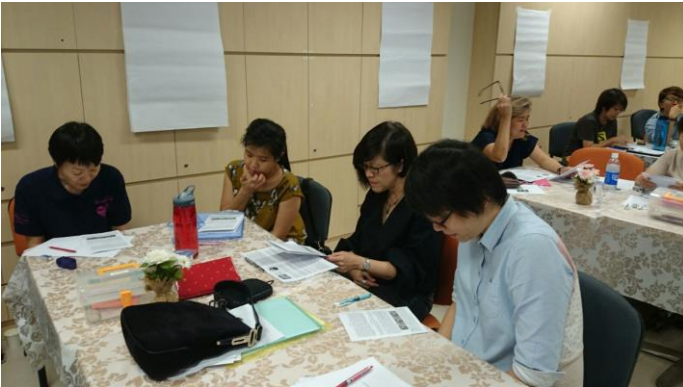
(Above) Participants in prayer reflecting on the theme: "Educating hearts and minds"

Teachers and past pupils who believe in the IJ education, mission and ideals and have a strong conviction of the need to keep the IJ identity, heritage and legacy alive in the CHIJ school, have asked for a 2 day session on understanding the "IJ Spirituality" and the IJ vision of education as envisioned by the founder.