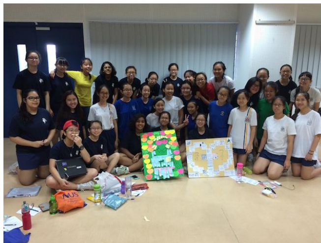
CHIJ TP students with their art and craft skills

All members participate in the annual IJ Youth Mission Inter-school Competition to showcase their community service and programme for the year. The IJ Youth Mission (CHIJ Secondary) has attained the Certificate of Distinction from 2014 to 2019.