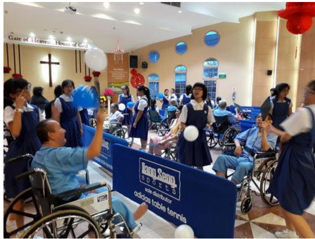
Interaction with the Elderly