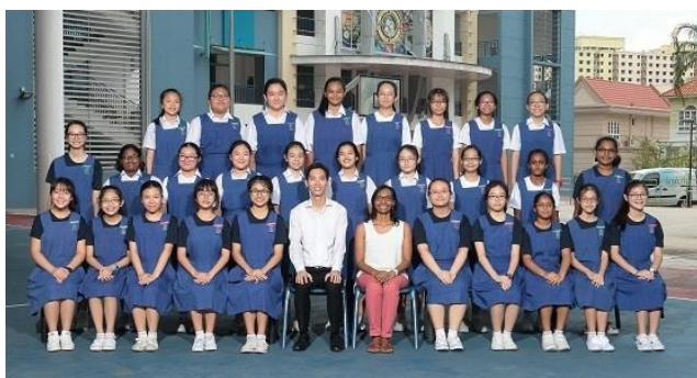
Our members with their teacher-Advisors

CHIJ St Joseph's Convent IJYM did successful outreach at the All Saints Home and also HOME. They had organized successfully an outing for HOME residents to SJC. The Shoebox project was also a great success. For 2016, SJC continued local mission outreach with All Saints Home and HOME.