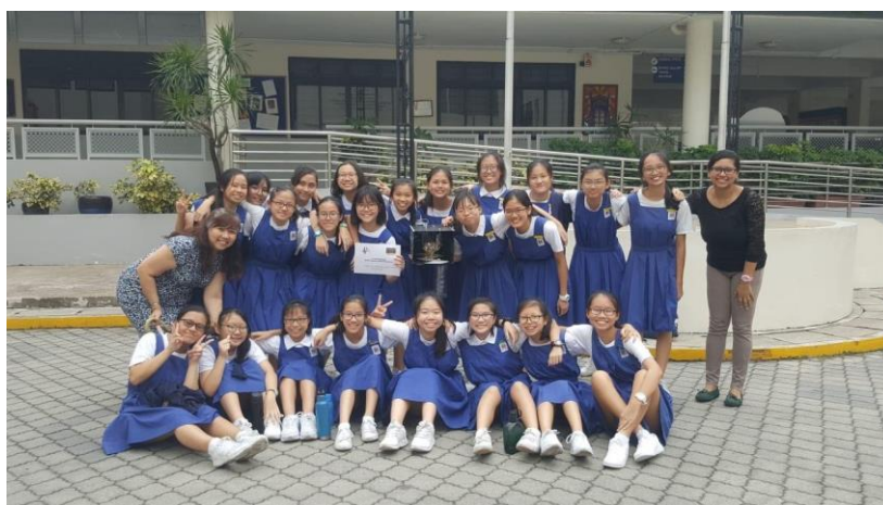
Our members with their teacher advisors

For 2016, SNGS continued working with SASCO to reach out to the elderly through their various centres and homes and forge a new partnership with APSN. With more teachers, various outreach activities can run concurrently, once or twice a month. SNGS continued their long-term mission outreach in Siem Reap @ Kbon Primary School. They raised funds to build their water tank. Girls are involved in the planning of outreach programmes. Continued self-initiated projects by the pupils are on-going.