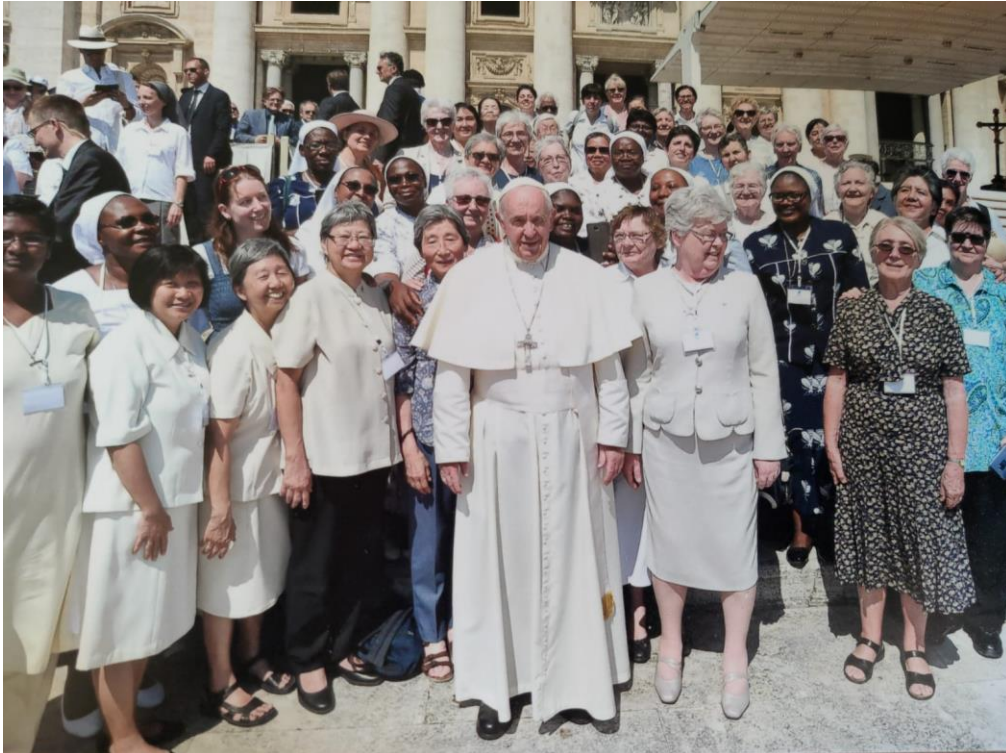
IJ Delegates attending General Chapter in Rome with Pope Francis