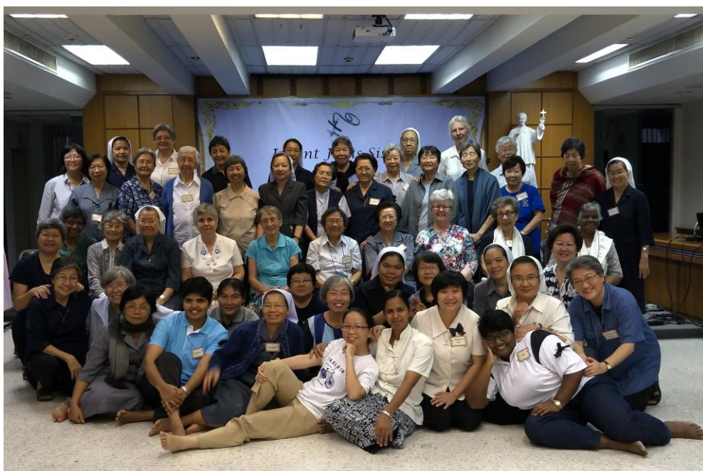
Asian Sisters at IJ Sisters' Forum in 2016