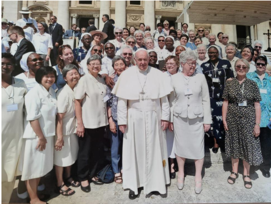
IJ Delegates attending General Chapter in Rome with Pope Francis

Today, as a group of women within the Church, being multi-cultural and multi-racial is very enriching for us. In many of our meetings, East meets West and North and South sit down together. This gives an opportunity to bear witness to the universality of the Kingdom of God where people of every race, nation and mentality are gathered. "Union of heart, mind and mission" is not something we want to live only among ourselves but it is something we wish to share with all those who, whatever their faith, are searching to live by the same values in today's society.