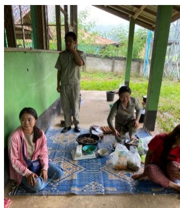
Parents roster themselves to boil the eggs and cook lunch three days a week.