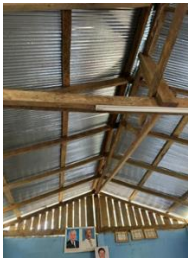
Roof not leaking now

Lunch project on hold as there is no kitchen!