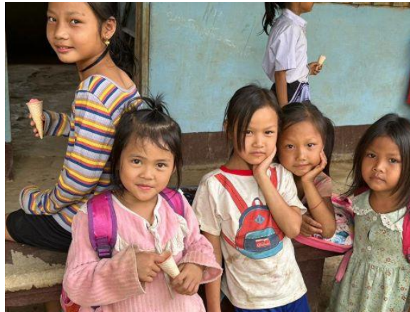
Children from the Lahu tribe at Pana School