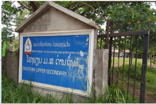
Danthin Secondary School

Provincialate : 4A Chestnut Drive, Singapore 679330. Tel: 67602461 website: www.chij-sisters.org