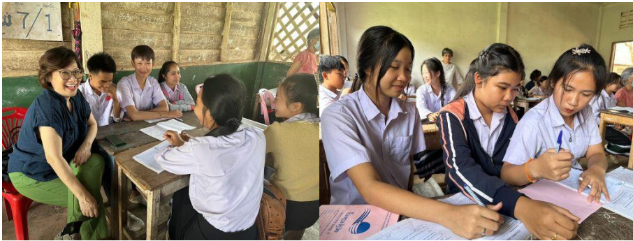
"New teacher" trying her hand at group work

Both lesson observations and lessons conducted by the team went well and met the objectives of having a better understanding of their standard of English and also to conduct lesson demonstrations.