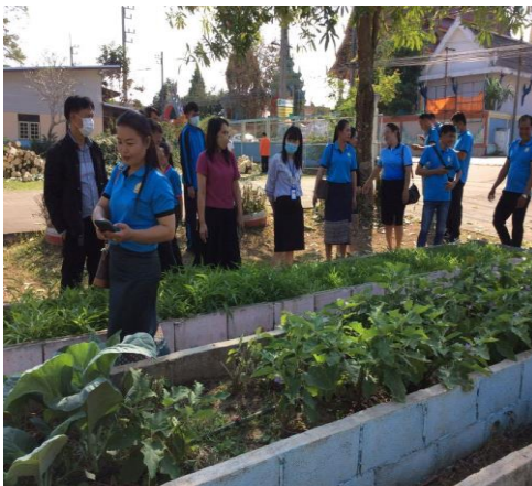
Laos teachers interested in agriculture