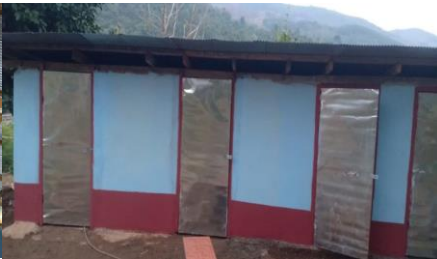
New toilets for students and staff of Pana Primary School