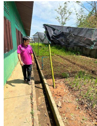
The vegetable garden

• English Language Training for Teachers. The proposal is for the English Language teachers to receive training during their school holidays.