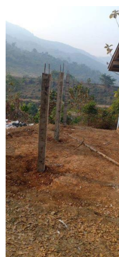
Preparing to build the water trough