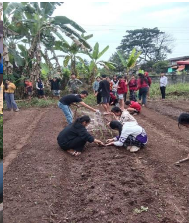
Carrying out what they have learnt