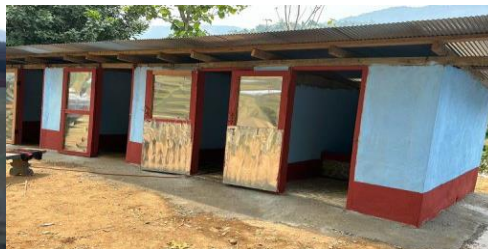
Danthin Secondary school also has new toilets!