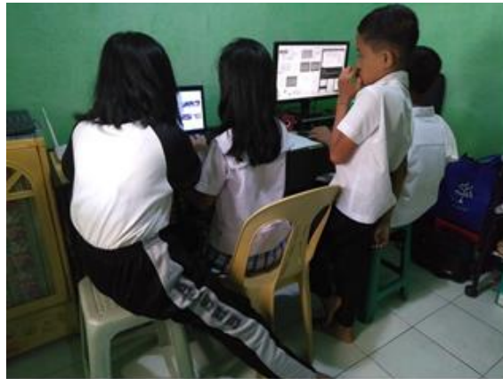
Children using the computers