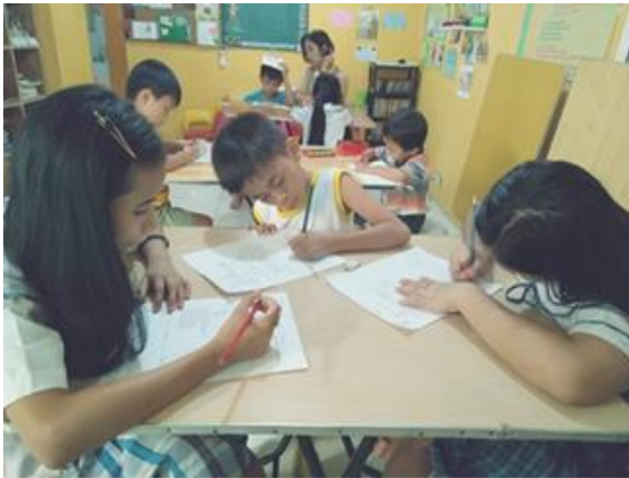
Children at their studies

"Whatever happens remain always at peace and trust the Lord." – Blessed Nicolas Barre