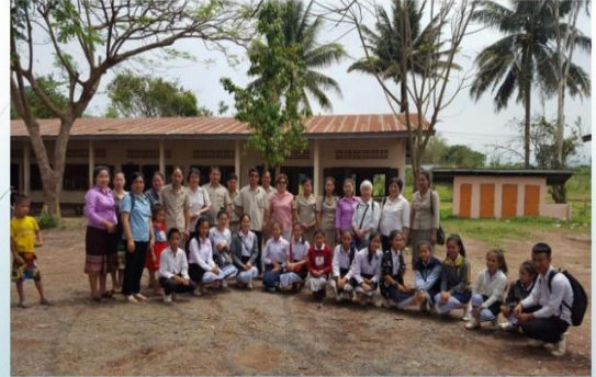
Our team with staff members and some students of Danthin Secondary School

Danthin Sec School has 34 teachers serving 470 students.