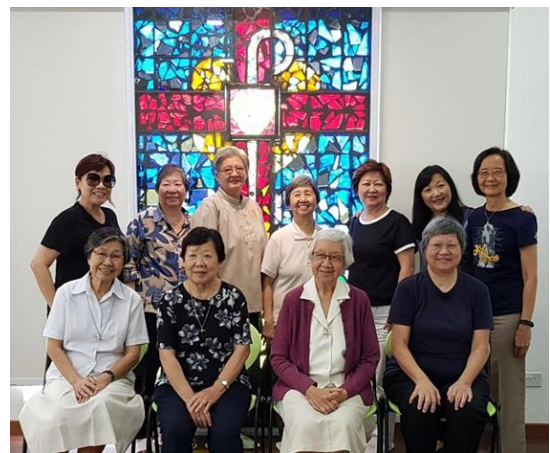
IJ Associates with the Sisters