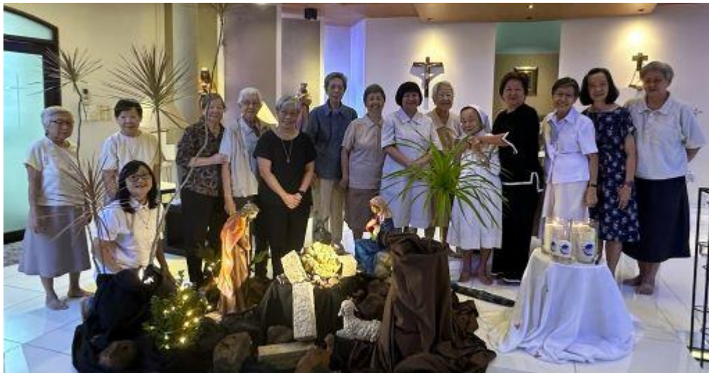
Sisters and Associates at the event in the chapel

Blessing of Ministries held on 31 Dec 2023