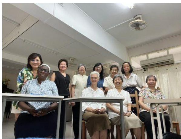
Srs with the Provincial Team and Associates