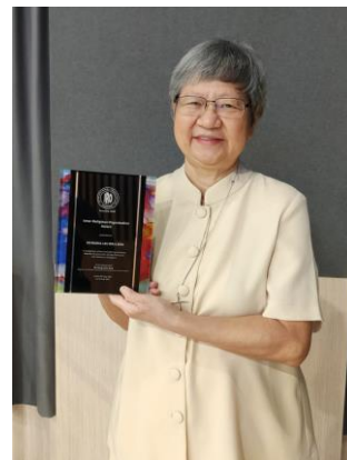
Receiving the award from Mr Heng Swee Keat

Read a related article in the Catholic News