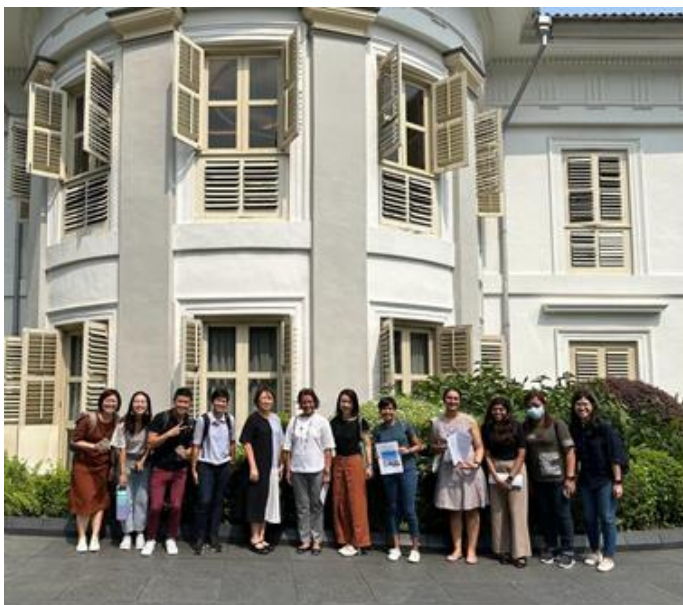
Outside Caldwell House