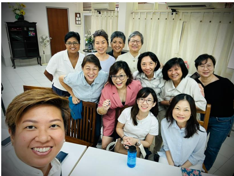
Some members of the IJHCC management Committee