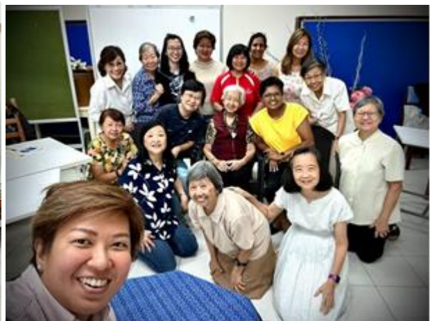
Some of our Aspiring IJ Collaborators with Associates and IJ Sisters

In our journey with lay people, we discover together how God continues to draw us to live the charism.