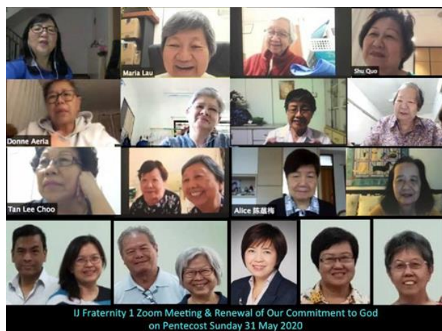
Our first Fraternity members

“We are companions on a journey called to deepen our understanding of the Infant Jesus (IJ) Spirituality given through Blessed Nicolas Barre which is the inspiration of the Infant Jesus Mission in all its expressions. We celebrate the spirit that has brought us together, has sustained us and informs us in the way we work and live to promote the Kingdom of God.” Amen.