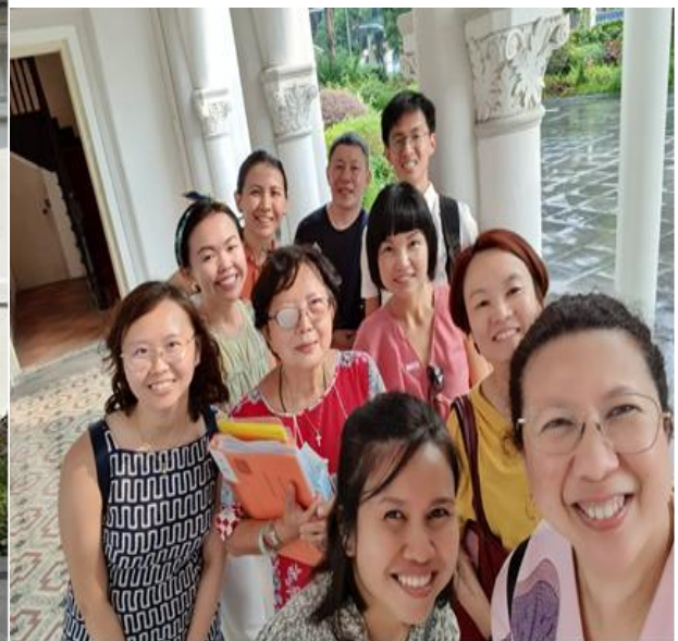
Near the entrance